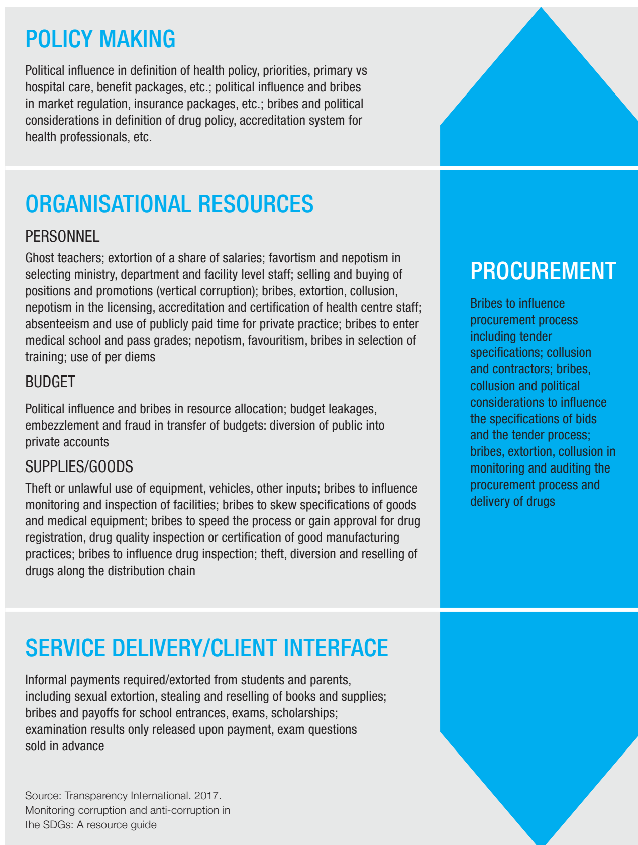
Figure 3: Analysis of corruption along the health sector value chain