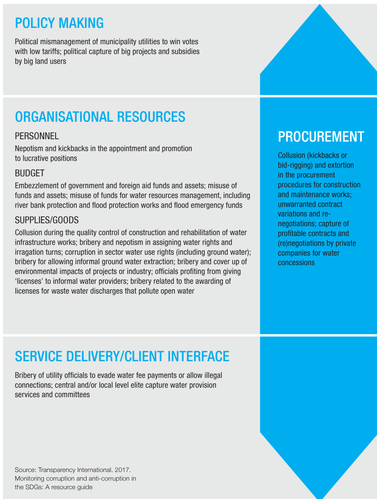
Figure 4: Analysis of corruption along the drinking water and sanitation sector value chain