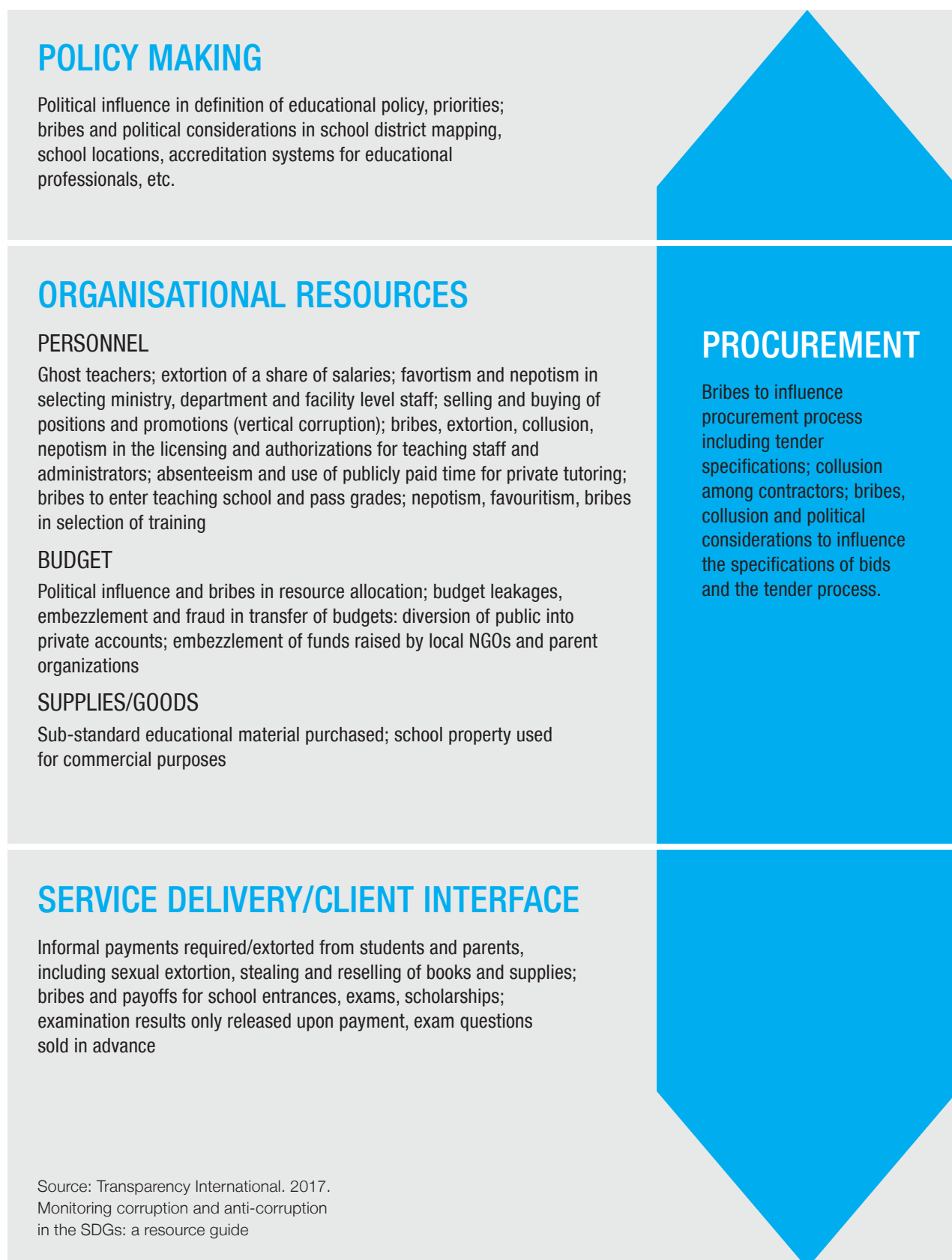
Figure 2: Analysis of corruption along the education sector value chain